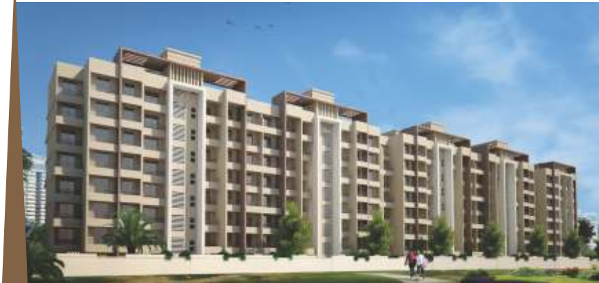
Konark Residency Shahad