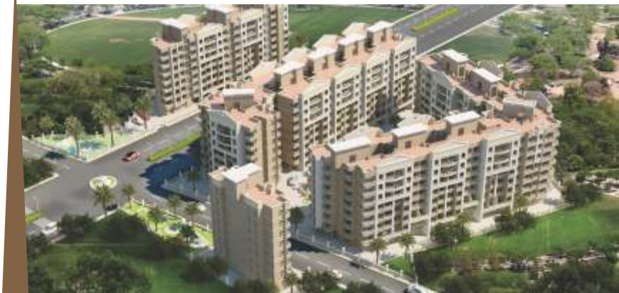
Konark Gardens Badlapur (E)