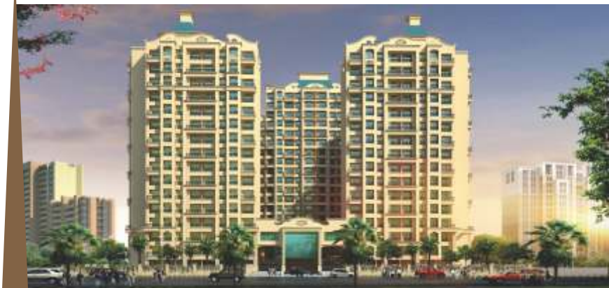
Royal Garden Kalyan (E)