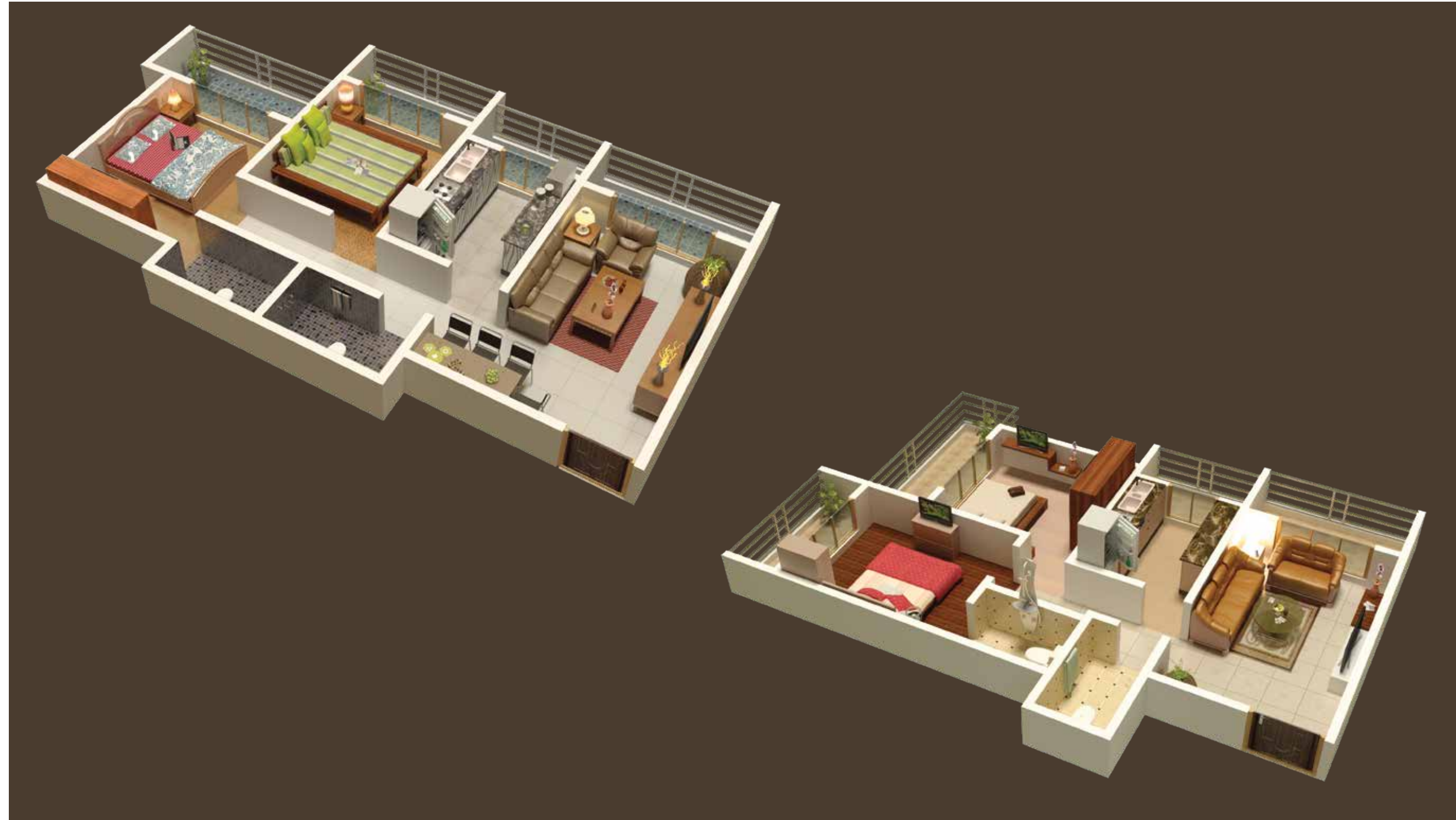
2 BHK APARTMENT