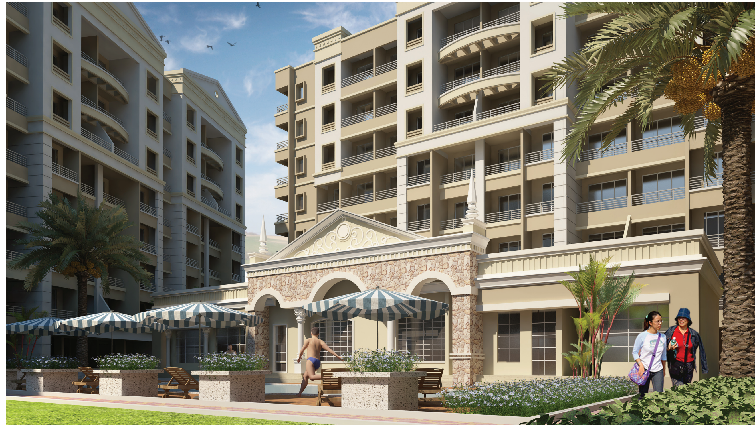
"Mount Park" The Club