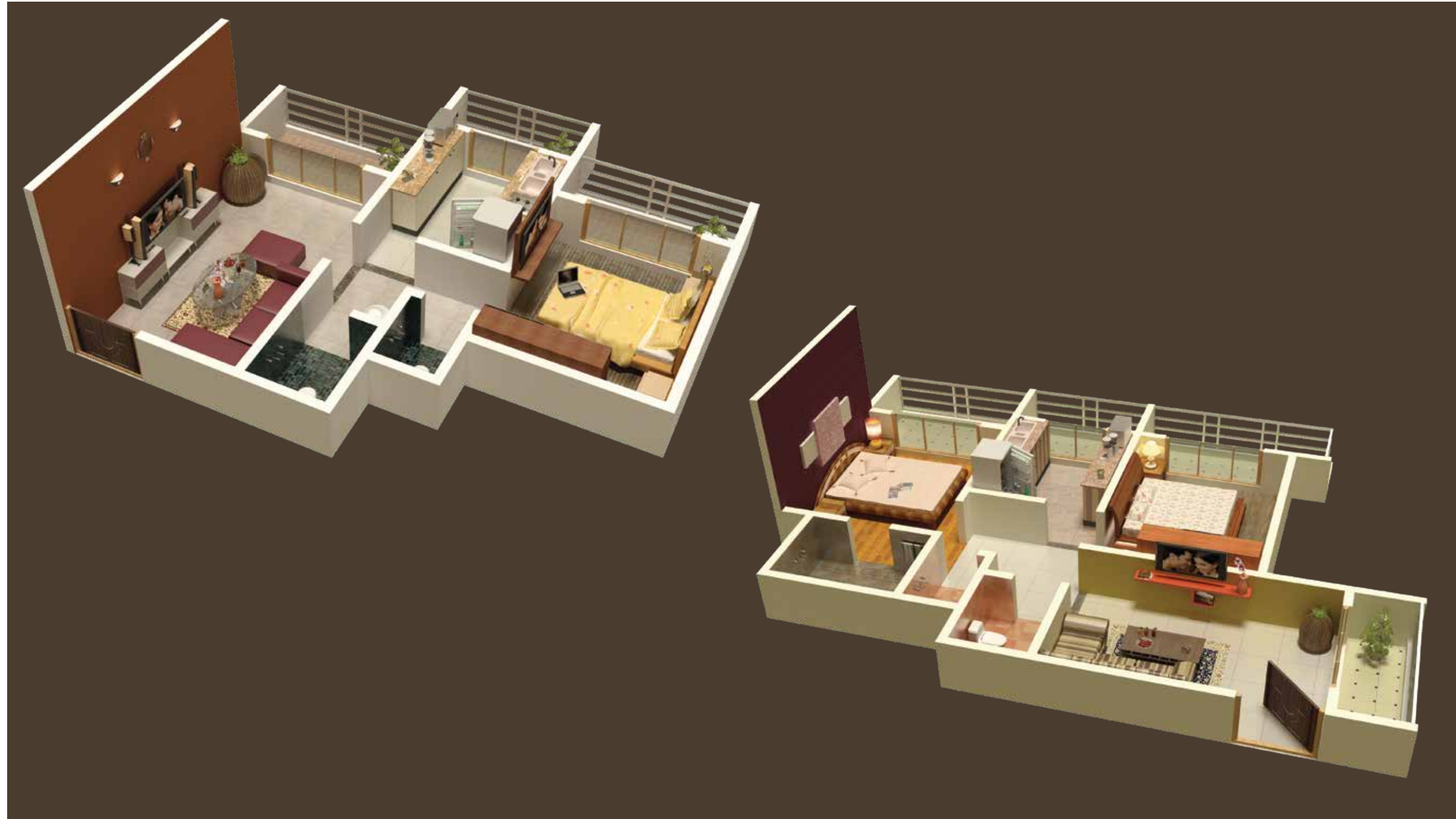
2 BHK APARTMENT